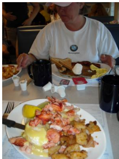
Lobster Benedict at the Maine Diner

Our next leg was just getting through Pennsylvania. I found out that your hat, like your helmet should be fastened snugly dammit. We stop in Newburg, NY on the Hudson River just down stream of Rhinebeck, NY (great rally site... and now THE place to get married). 444 Mile 8 hrs.