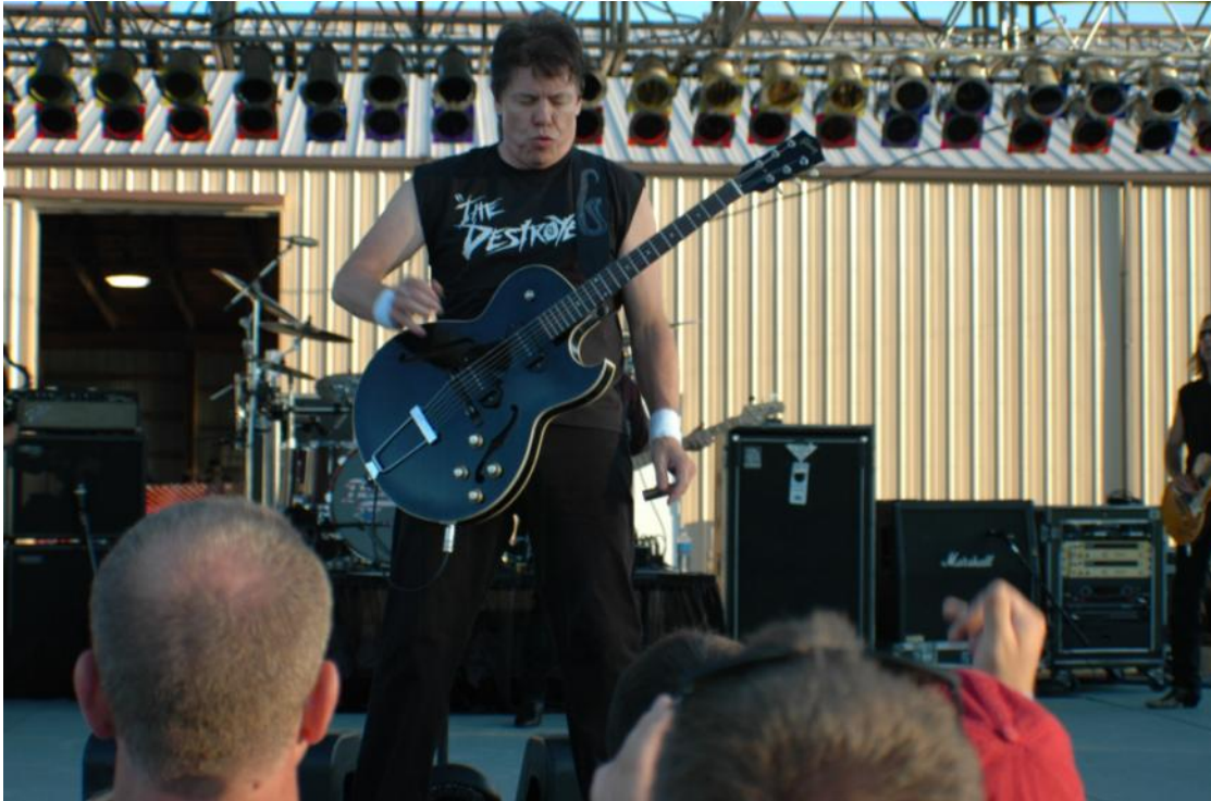
George Thorogood at the MOA National Rally in 2005.