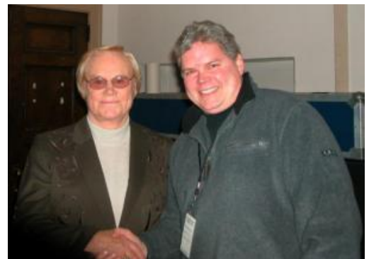
That's me and George Jones. Nashville 2003